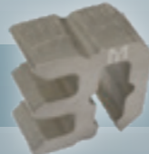
Material : SUS304 Thickness : 30 mm (1.18") Assist gas : Nitrogen