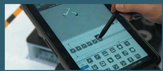
Intuitive robot programming by simply selecting command icons

When considering the introduction of robots, the first issue is the "difficulty of introduction". Conventional robot systems require a lot of time from installation to operation because the installation takes several weeks. Another challenge is that operating the robots requires specialized knowledge, making it difficult to ensure stable operation at sites where human resource is in short supply. Mazak launched the Ez LOADER 10 last year to